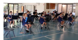
WATCH: Our Concert Band play 'Tequila'