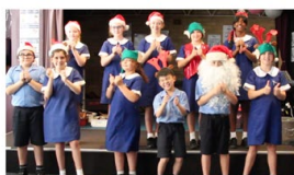
WATCH: Choir signing 'You Got a Friend in Me' from Toy Story

We wish you every blessing for Christmas this year and know that you are in our hearts and prayers.