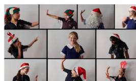
WATCH: Choir performing 'T was the Night Before Christmas'