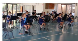
WATCH: Our Concert Band play 'Rockin' Robin'