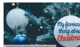
WATCH: A special Christmas message for you from our Choir