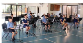
WATCH: Our Training Band (beginners) play the pieces they have been learning in Term 4